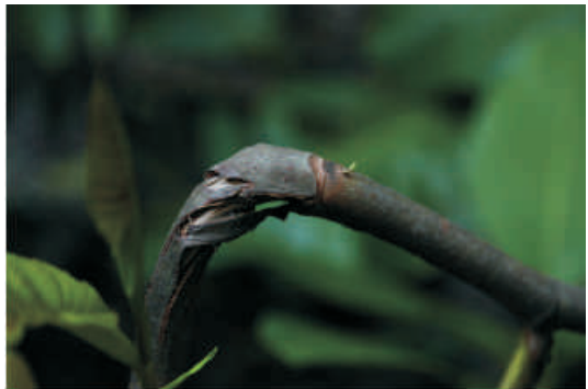
Twisted Saplings

The Sumatran Rhinoceros is mostly solitary except for courtship and child-rearing. It is the most vocal rhino species and also communicates through spraying urine, scraping soil with its feet and small trees with its horn, and twisting saplings. Individuals have home ranges: males believed to be up to 5,000 ha, females up to 1,500 ha, with females spaced apart, and males overlapping with other rhinos. Weights of mature Sumatran rhinos in Sabah are