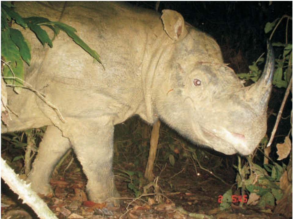
Camera trap picture of wild female rhino in LKSJ, February 2007

LKSJ consists of coastal swamp forests of the lower Kinabatangan, Segama and Kretam rivers up to Tambisan island on the north side of the Dent Peninsula, incorporating mangrove, nipa swamps, nibong forests,