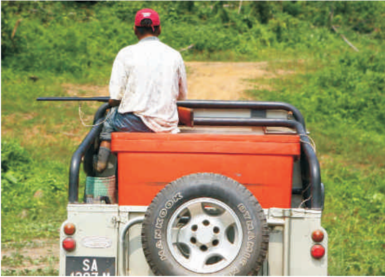
Hunters using a four-wheel drive vehicle (illegally) in Ulu Segama Forest Reserve.