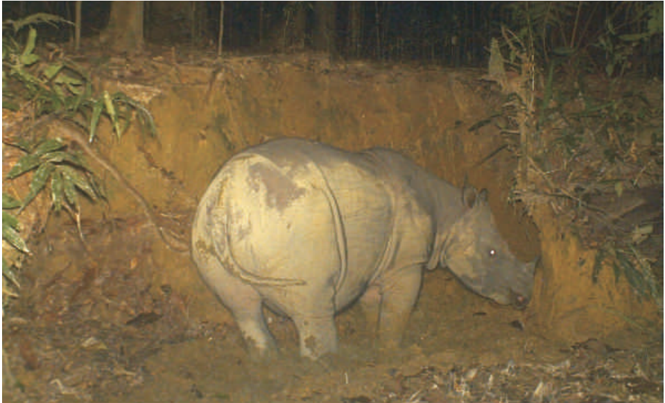
Camera trap picture of wild female rhino in Danum Valley, February 2010