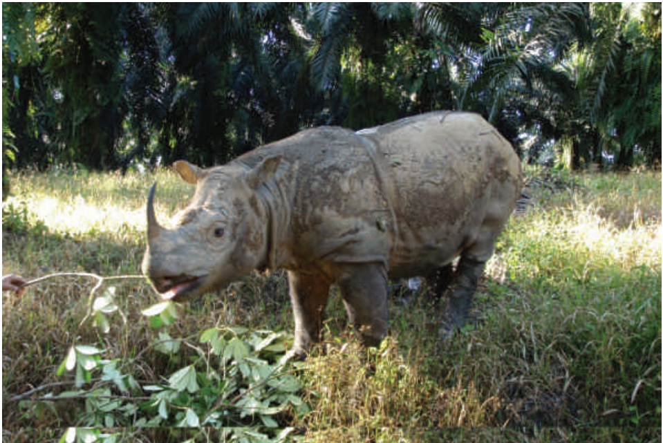
The male rhino Tam just before his capture in a plantation, August 2008

Other locations with reports of the presence of rhinos in recent years include : Kalabakan Commercial Forest Reserve, near the border with Kalimantan (rhino poached here in 2001); Malua Commercial Forest Reserve, some 20 km to the north of the main logging road between Silam and Kuamut (2007; reported by Kinabatangan Orang-utan Conservation Project) and apparently isolated from the Danum Valley rhino population; middle Kuamut River (2009; report to BORA from people of Dagat and Kuamut); and to the south-west of Maliau Basin (2009; report to BORA from Datuk Clement Jaikul).