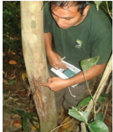
Mark of a Sumatran rhino horn on a tree trunk.

Behaviour may be linked to keeping as cool as possible, necessary but difficult for an animal with low body surface area to mass ration in humid tropical forests. During the day the rhino wallows in mud wallows (presumably to cool and to maintain skin condition), which are developed and maintained by the rhino digging with the horn and feet. Wallowing occurs in bouts of about two to four hours. In rainy periods, rhinos tend to move to higher elevations, while in dry periods they stay nearer to larger rivers.