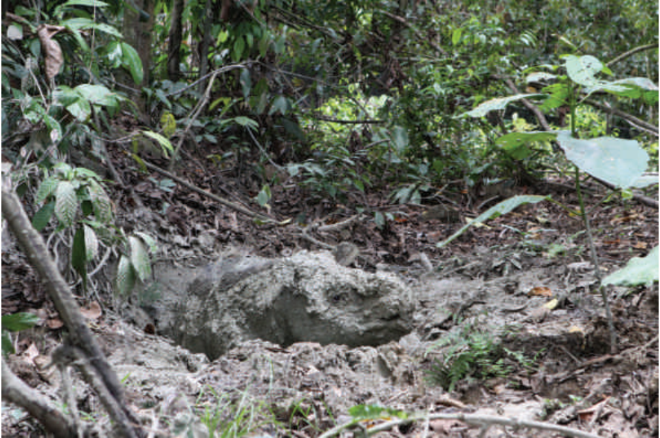
Tam in a mud wallow.

A permanent base that has indirectly helped to dissuade poaching since 1985 is the Danum Valley Field Centre ( www.searrp.org/danum.cfm ). A ten year sustainable forest management plan has been prepared by Sabah Forestry Department for the 2,400 sq km of logged forest surrounding DVCA, and implementation (mainly forest restoration) is underway ( www.forest.sabah.gov.my/download/2006/22f%20USM%20&%20Ulu%20Kalumpang.pdf ).