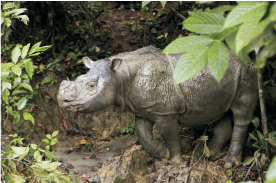
Sumatran Rhinoceros in Malaysia (Sabah).

Based on morphological characters, Groves (1965) favoured separation of the Borneo form of the Asian two-horned or Sumatran rhinoceros ( Dicerorhinus sumatrensis ) as a distinct sub-species ( D. r. harrissoni ), with D. r. sumatrensis regarded as a single form occurring in Sumatra and Peninsula Malaysia. Based on mitochondrial DNA, however, Amato et al (1995) concluded that all Sumatran rhinos in Indonesia and Malaysia should be regarded as a single conservation unit. More recent (2010, unpublished, Zainal Z Z, pers. comm.) comparison of DNA from Sabah, Peninsular Malaysia and Sumatra also suggest that rhinos from all three areas are very closely related. These results are of great significance: the Sumatran rhinoceros is now so highly endangered that mixing of Bornean and Sumatran forms in captive situations represents a potentially significant means to increase the number of births.