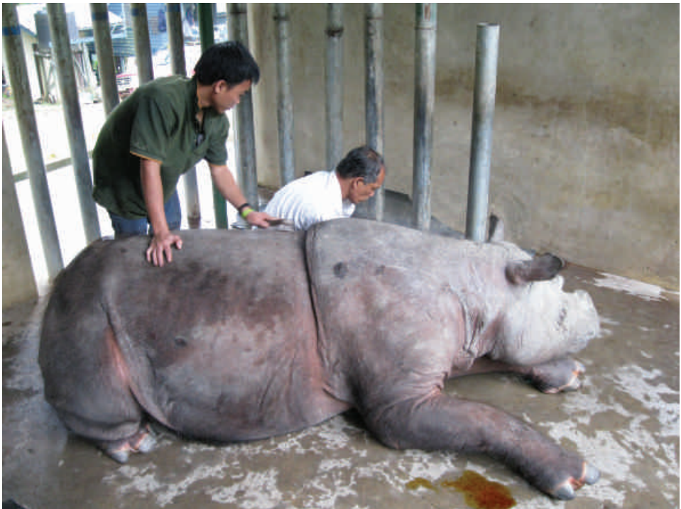
Female rhino Gelogob in night stall, undergoing routine health care

A key and necessary action following from Actions 2, 3, 7 and 8 is to "rescue" and translocate to BRS those rhinos which are deemed to be reproductively isolated and/or unable to contribute to the species survival and/or needed to contribute to the purpose of BRS. Selection of rhinos to be brought to BRS will depend to a large extent on objective criteria applied to Actions 2, 3 and 7, but action will also need to be taken on any unplanned opportunities that may arise (e.g. if a rhino leaves forest and enters a plantation).