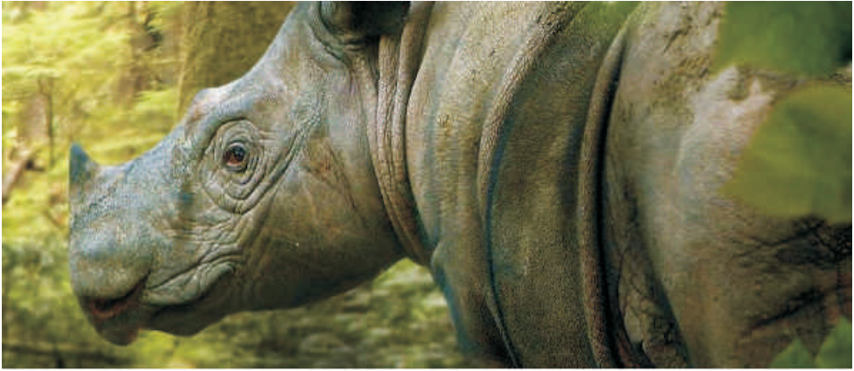
Sumatran Rhinoceros in Indonesia (Sumatera).