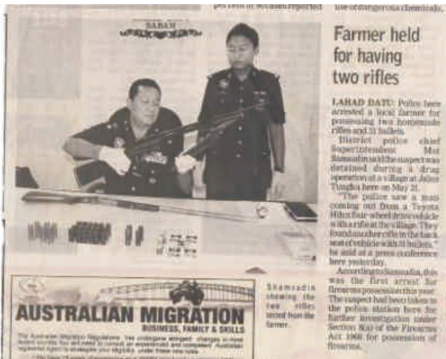
Examples of fire-arms used by people living south of Tabin Wildlife Reserve.

The rhino in Sabah represents one of the few examples of a tropical large mammal where forest loss is not a major issue threatening the species anymore. There is adequate habitat already. Conservation efforts can focus, therefore, exclusively on minimizing human-induced mortality and on bringing fertile females and males together.