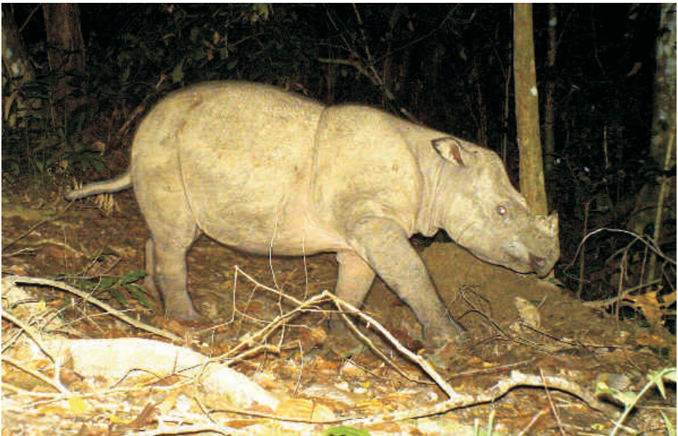
Camera trap picture of wild female rhino in Tabin Wildlife Reserve, April 2010

TWR is a category of Forest Reserve ( www.forest.sabah.gov.my/caims/Tabin ), under the authority of the Sabah Forestry Department. Sabah Wildlife Department has the powers to operate wildlife protection and conservation work within the Reserve. TWR consists of about 1,220 square kilometers of regenerating logged forest (this also includes the Mount Hatton Core Area of about 80 sq km of primary forest). There is a permanent government guard station of 13 staff run by Sabah Wildlife Department ( http://www.sabah.gov.my/jhl ) on the western border of Tabin, assisted by rhino protections units (RPUs) run by a non-governmental organization, BORA. Policy level aspects of the management of Tabin Wildlife Reserve come under a special committee chaired by Sabah Forestry Department. Sabah Forestry Department has three guard stations, on the north-east (at Sungai Lasun), south-west (at Sungai Ireton) and south-east (near Tungku) edges of Tabin, primarily to guard against illegal logging. Frequent routine air, ground and (off the north-east) boat surveillance is done around the