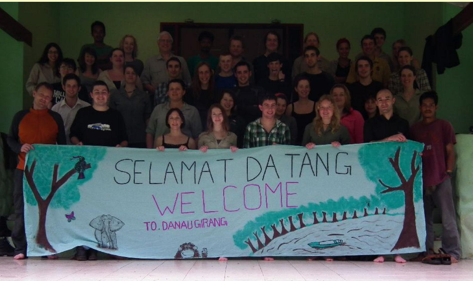
Staff and students of DGFC and Glamorgan University