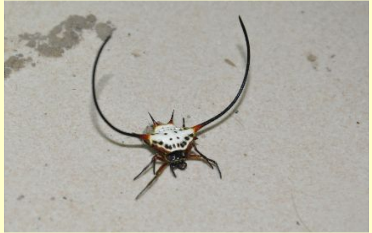
Many of the student's favourite spider