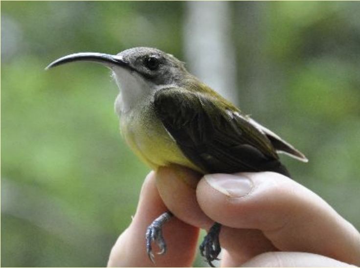
A student learning bird handling techniques

At the beginning of the month, Danau Girang Field Centre hosted the visit of 30 students from Glamorgan University in South Wales. The field group consisted of a mixture of undergraduate students and master students. Some of the undergraduates who arrived as part of their course 'International Wildlife Biology', one of the only courses of its kind in the world!. For the majority of the students it was their first time in tropical forest, however many of them were hardened from a previous field trip in South Africa which included tracking lions and gaining rifle skills.