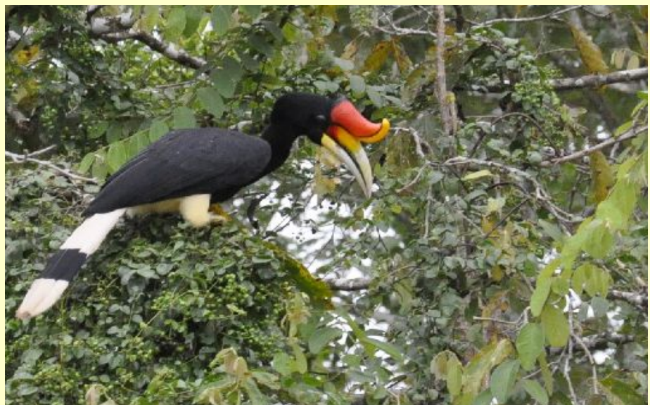
Rhinoceros hornbill spotted on a primate survey from the boat