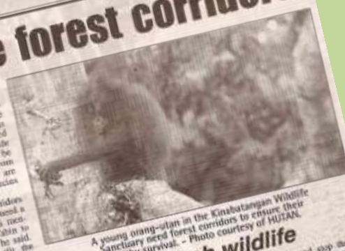
A young orang-utan in the Kinabatangan Wildlife Sanctuary need forest corridors to ensure their healthy survival.

Plantations urged to create forest corridors Friday June 11, 2010 13 HOME Plantations urged to create forest corridors By creating such corridors of forest, we hope orangutans and elephants will be able to move from one jungle to another, reducing the risk of in-breeding which can lead to a population decline," he said. Plantations also have other reserves which can be created as suitable habitats such as creating a suitable buffer zone at river banks as instructed by the Sabah Government more than five years ago, as this will help in reducing pollution from run-off and of course help wildlife to move about. "The government expects the oil palm industry to be more mature and responsible, and for those who have not done what is necessary to do so right now, start to do so right now," he said. He said that while some countries are willing to contribute to conservation, he said that the oil palm industry has started to do so right now, and that is a good sign. He said that the oil palm industry has started to do so right now, and that is a good sign. He said that the oil palm industry has started to do so right now, and that is a good sign.