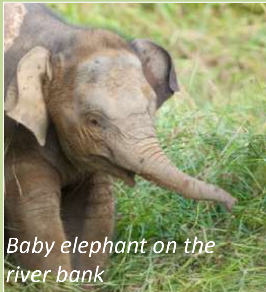
Baby elephant on the river bank

Apart from seeing gibbons (!!!), numerous orang-utans, proboscis monkeys, leaf monkeys, crocodiles, hornbills, frogs and many many more, they also had a front row experience on the river bank with the ever fantastic