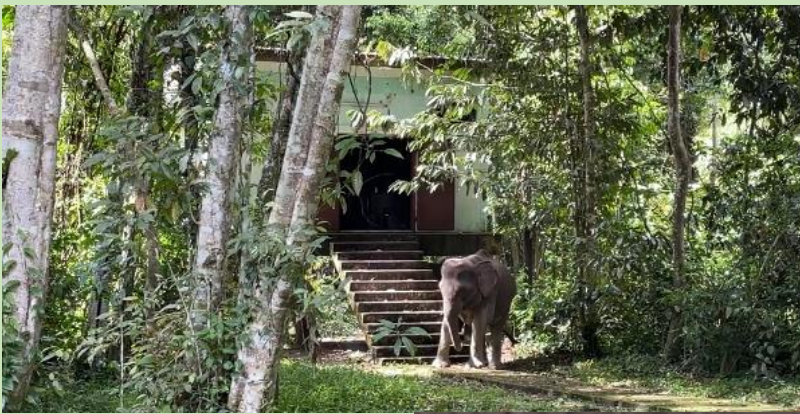
This young female was seen guarding the entrance to our generator room (left)

Throughout June and July, DGFC was regularly visited by a herd of approximately 40 individuals. They were spotted right next to the centre as well as enjoying themselves down by the banks of the Kinabatangan. We love seeing them here as they never fail to make us smile! Below are just a few pictures from their visit!