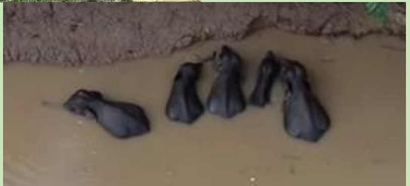
These 5 were spotted by one of our drones taking a bath (right)