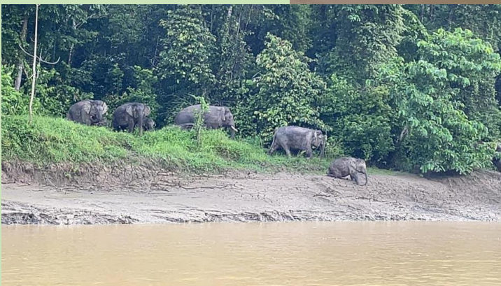
Here the herd are preparing to cross the river, seemingly being led by an enthusiastic infant (left)