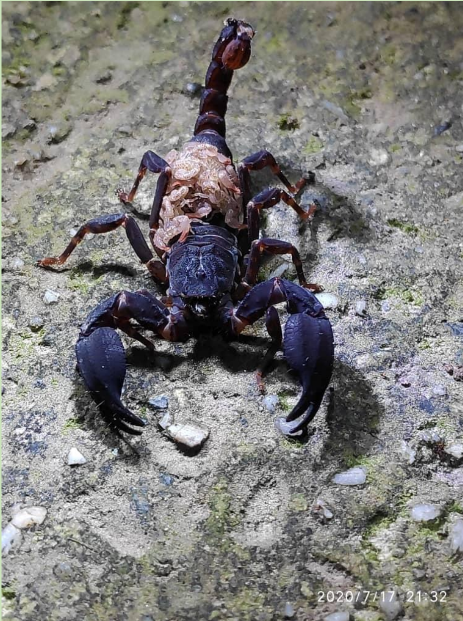
A mother Malay forest scorpion carrying her babies.