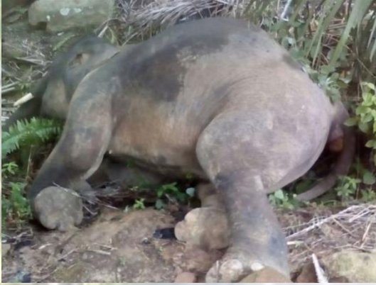
shows the tragic loss of Jumbo the young male.

On the 19 th of November an Indonesian man was sadly trampled to death by a young bull elephant whilst working at a timber plantation in Tawau. In response to this tragic event, the Sabah Wildlife Department rangers were sent to cull the young male elephant.